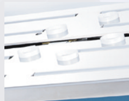
Auto loop ejector