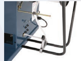
Auto strap feeding