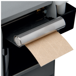
Superior Mechanics and Guillotine Blade Delivers clean, even cutting of reinforced and non-reinforced tape