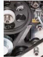
Free access to strap guides