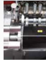
Robust & compact mechanical strapping head