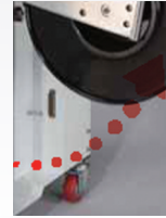
Waist high quick coil change