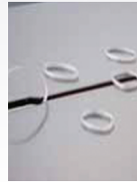
Auto loop ejector