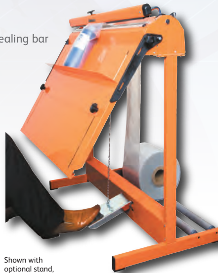
Shown with optional stand, foot pedal and film holder