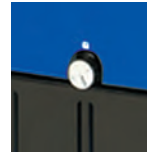
Manual strap tension control