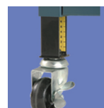
Adjustable table height