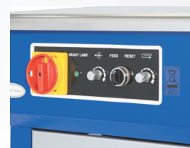
Simple to use control panel