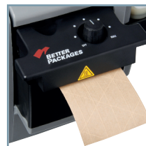
Automatic Function Allows the operator to specify tape lengths and will automatically dispense them in a pre-configured sequence, to dramatically increase productivity.