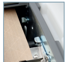
Steel frame construction covered with ABS plastic For strength, durability and impact resistance.