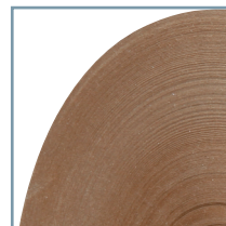
Largest tape capacity in the industry Eliminates the need for frequent roll changes.