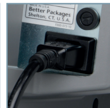
Extra long detachable cord For improved operator ease, comfort and safety.