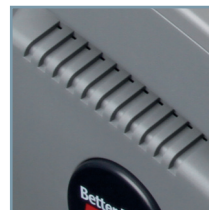
20% increase in motor power For longer life, cooler running and smoother operation.