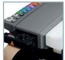
Ergonomic design Allows for operation from either side of machine.