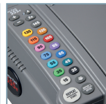
Programmable Keys Set tape lengths up to 305cm depending on model. Tape length is adjustable (up or down) in 12.7mm increments.