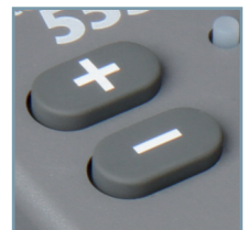
Random Key Length To allow tape to be dispensed in any length.